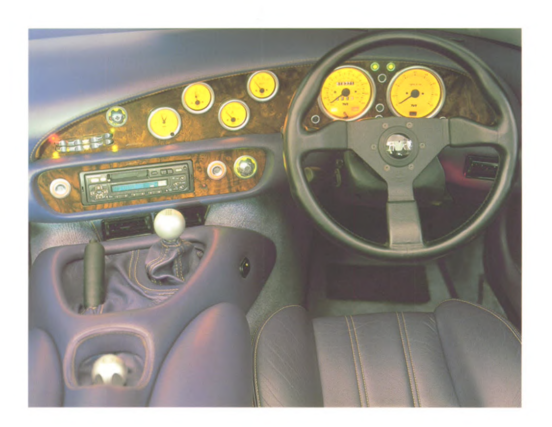
"Its spacious cockpit is a dream too, with wood, leather and polished aluminium styled by someone who truly understands interior design" Jeremy Clarkson, BBC Top Gear Magazine March 1998