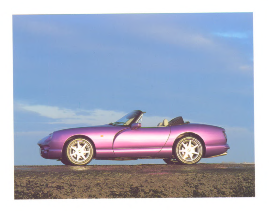
"Behind those seats there's a large parcel shelf and the Chimaera's huge boot easily swallows its hard centre roof section"