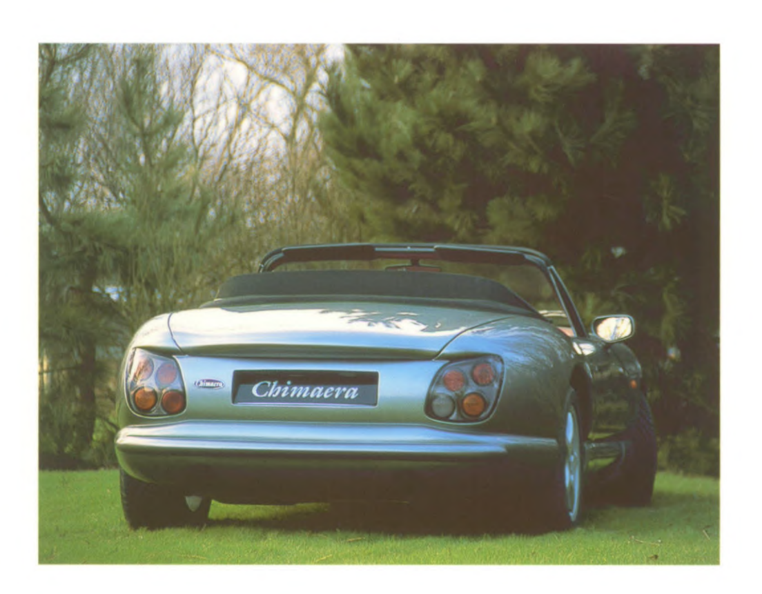
"the Chimaera is great fun to drive even when you're just tootling along"