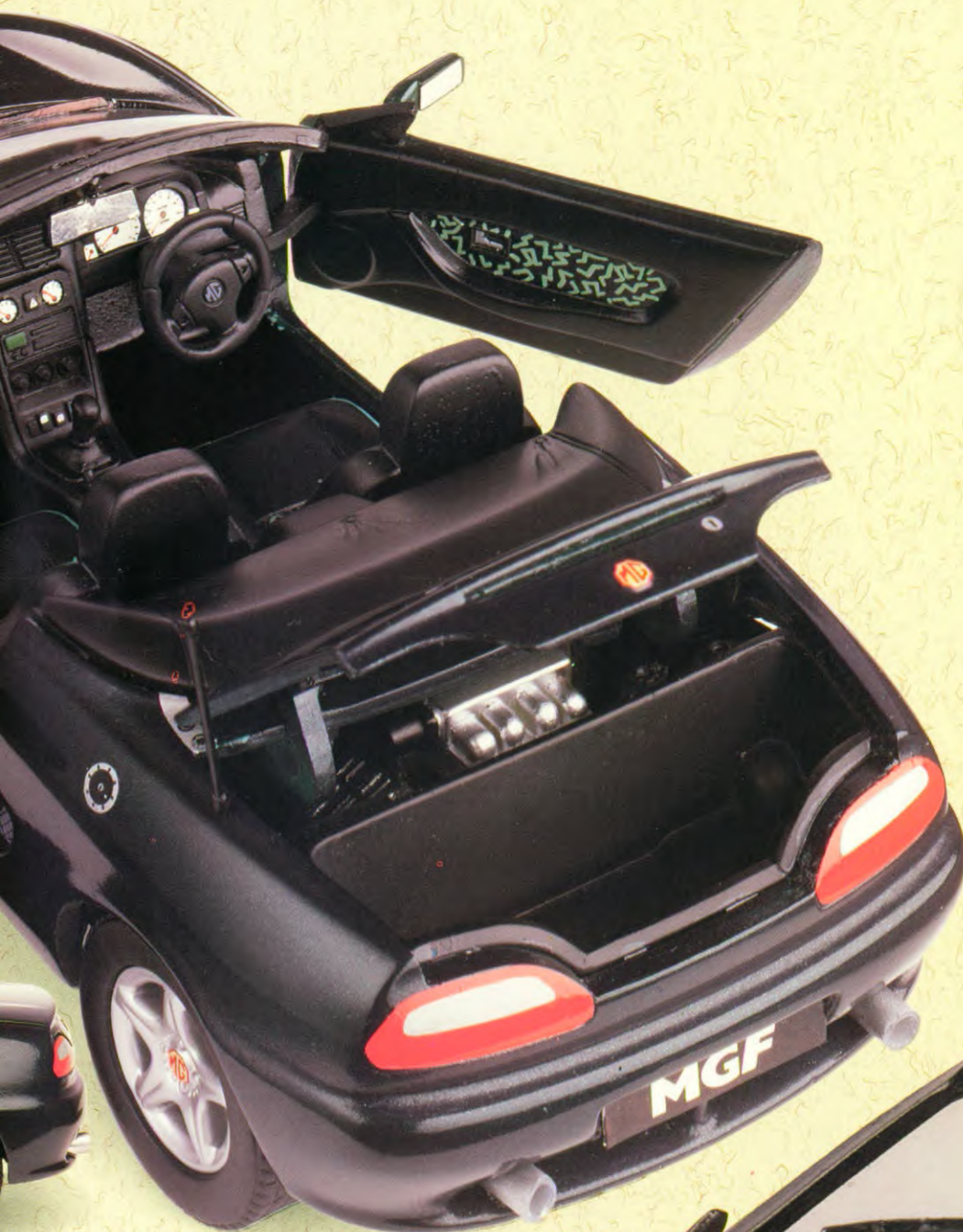
95102 MGF OPEN TOP Metallic British Racing Green

These superbly detailed 1:18 scale diecast models are available in two versions. The standard versions are supplied with black plastic display plinth and are packed in an attractive window box. The deluxe versions are supplied with a wood-veneered plinth complete with a brass name plaque, an enamelled MG badge, a numbered Limited Edition Certificate and are packed in a luxurious "leather effect" gift box. All models feature fully detailed engines and interiors, working steering and soft seats.