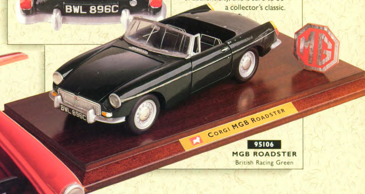
95106 MGB ROADSTER British Racing Green