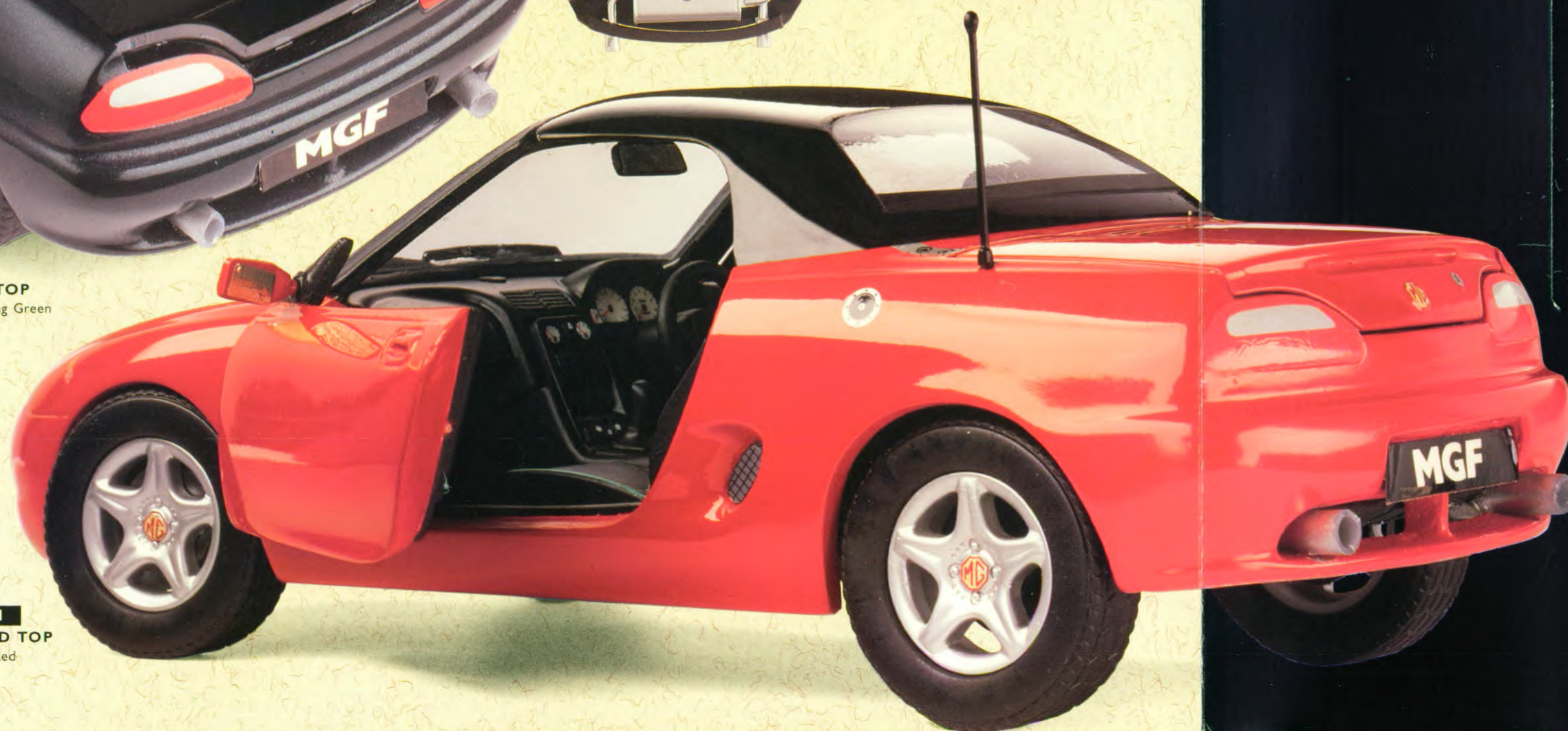
95101 MGF HARD TOP Flame Red