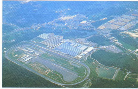
Shiga (Ryuo) No.1 and No.2 Plants and Technical Centre

Each Daihatsu vehicle reflects our international leadership in compact-car technology. And today, backed by 90 years of experience, Daihatsu remains committed to developing outstanding compact cars that answer the emerging needs of a "compact-oriented" society as we move into the 21st century.