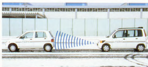
Advanced safety vehicle