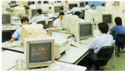
Computer aided design

Creative vision and flexible planning are the keys to Daihatsu's ability to continually create new vehicles that respond to today's diverse lifestyle needs. Our high level of technology is the key to giving a marketable form to this vision. At the same time, we place great emphasis on creating the safest vehicles possible. Strict testing at highly advanced facilities helps assure that each of our vehicles stands out for both safety and quality.