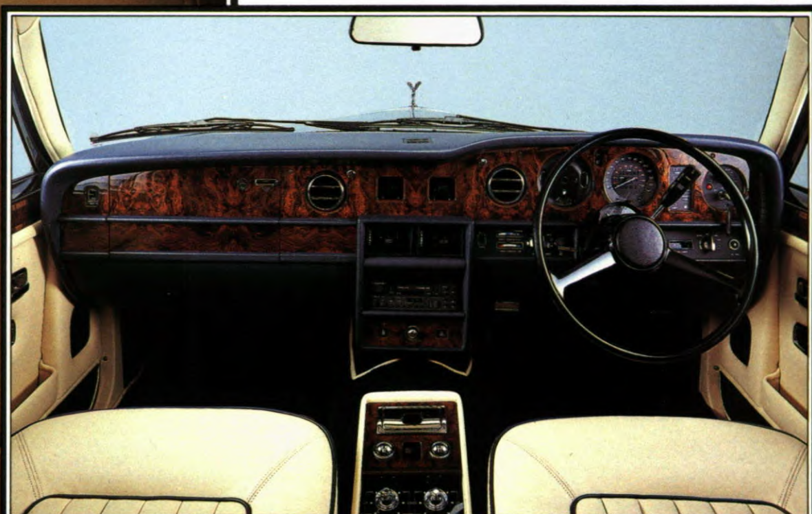
Silver Spirit ▲