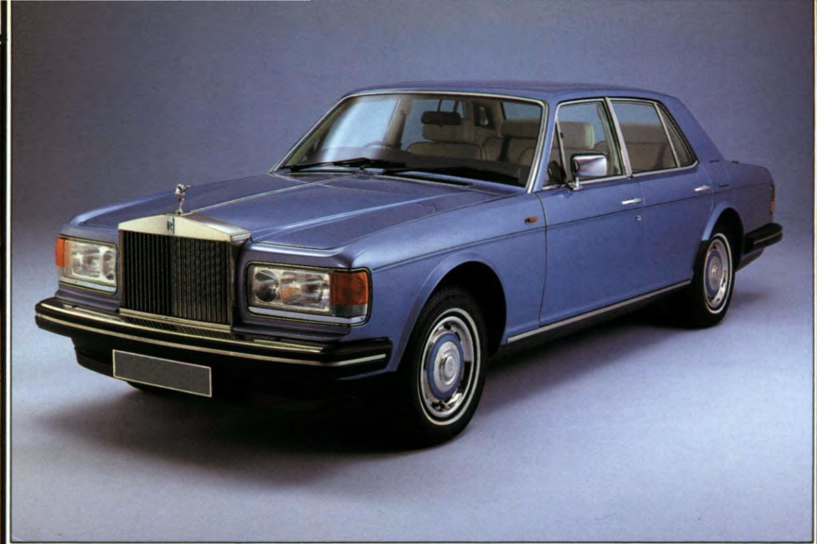
Silver Spirit ▲