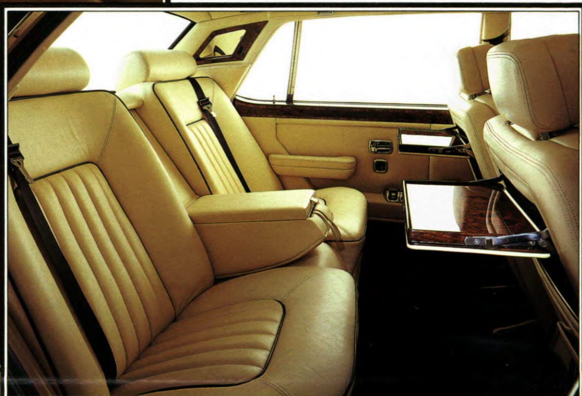
Silver Spur ▼